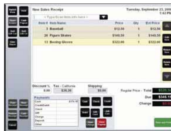
Point of Sale Cashier Screen