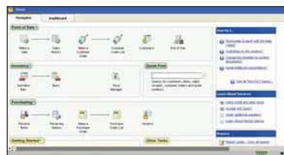
Visual Navigator Screen